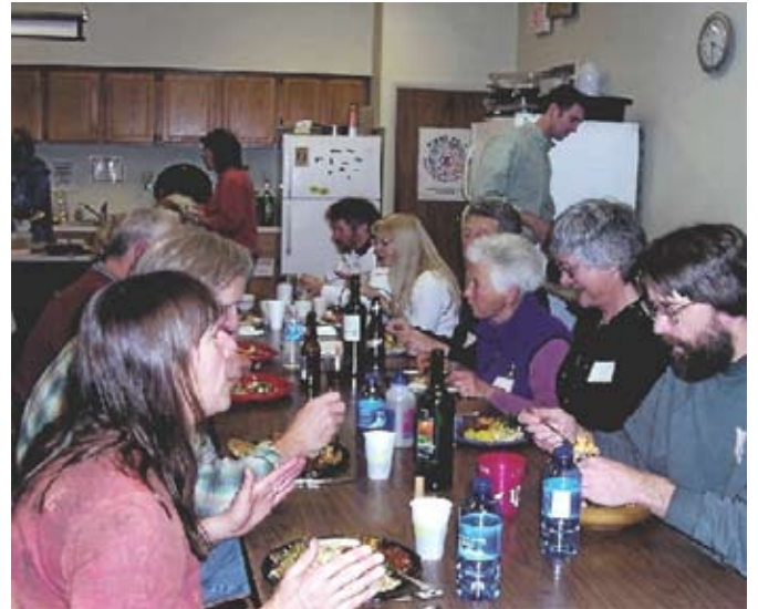
Two thirds of the outstanding turnout at the Fall CNSC Dinner Meeting