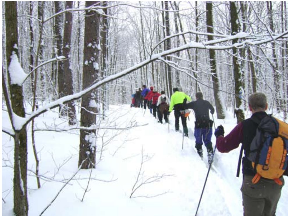
The conga line blazing the trail

I smartly “swept” rather than “led”, took turns breaking trail through many of the untracked areas. These forerunners included many of the fastest skiers who normally leave the rest of us tortoises far far behind. As someone said, the big snow was “The Great Equalizer”, as about an hour into the tour all of us ended up back in a group and for the next few hours we all skied together. Considering who was on the tour, THAT was unprecedented, as in my experience with some members (and you know who you are) the only time I see them is to say “hi” at the beginning and maybe “bye” at the end if their time looping the trail twice coincides with my once around.