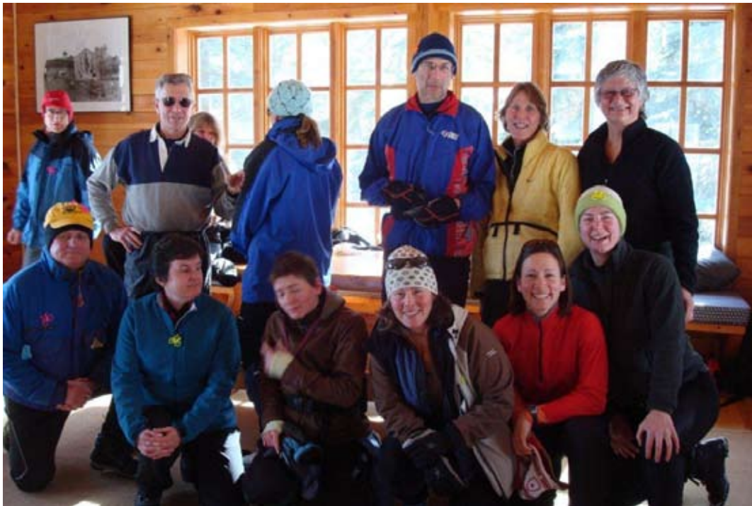
A small fraction of the large percentage of the club members who journeyed to the BREIA trails this February